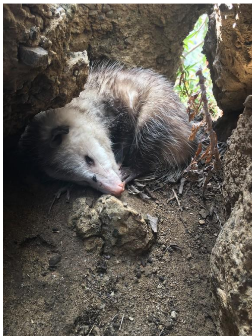
Our friend the possum.

This is a moderately easy hike off of Glendora Ridge Road, near the village of Mt. Baldy. It involves about 5 miles of hiking, 1400 feet of elevation gain, and a maximum elevation of 5,796 feet.