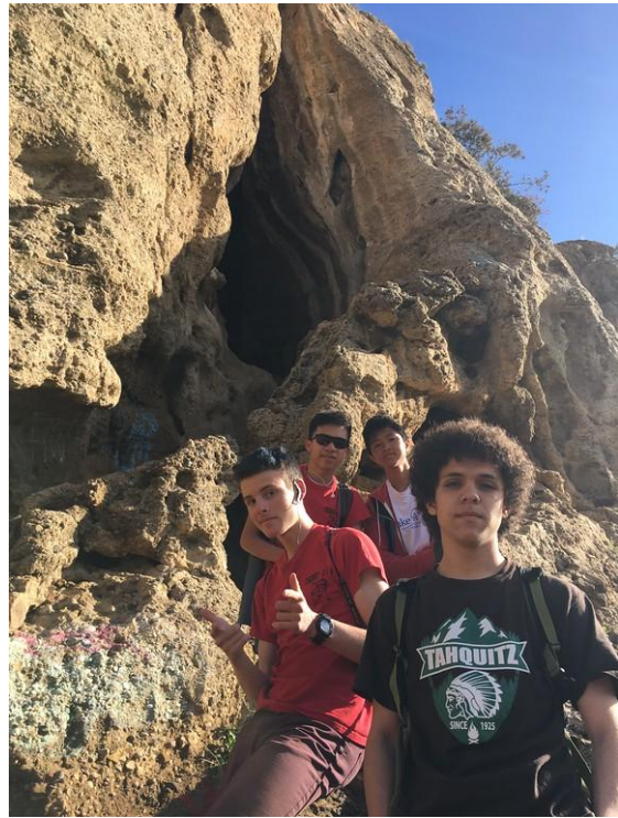
The mouth of the Cave of Munits.