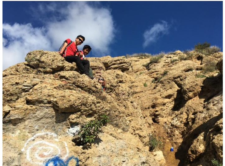
On the "roof" of the cave

After exploring the cave, we climbed out the top of the cave onto the hillside, and proceeded up to the ridge. From there we had to do a little route-finding, but easily reached Castle Peak, which, though it is actually lower than the cave, affords a panoramic view of the West Hills area and the San Fernando Valley to the east. We also discovered a possum sleeping in a rock crevice up there!