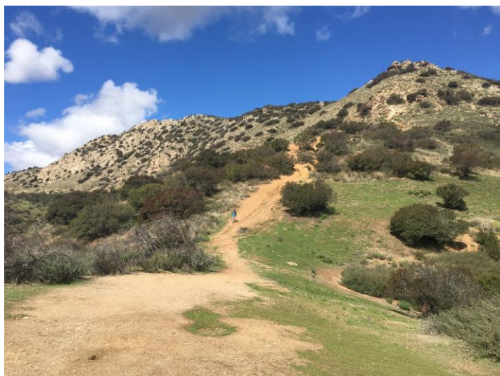
Looking behind us. Castle Peak on right, Cave on left.

Although it takes an hour to drive to this place, it was well worth it, and we had a wonderful time.