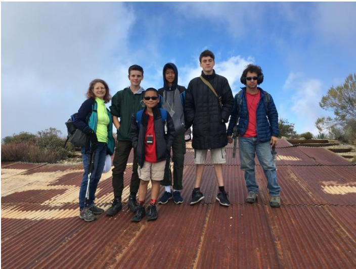
Our group at the summit.

We reached the summit at about 11:00, and ate our snacks and lunches on the tin cover of the old rain-gathering system. There used to be a fire lookout tower here, but all that remains is the concrete footings and this water system.