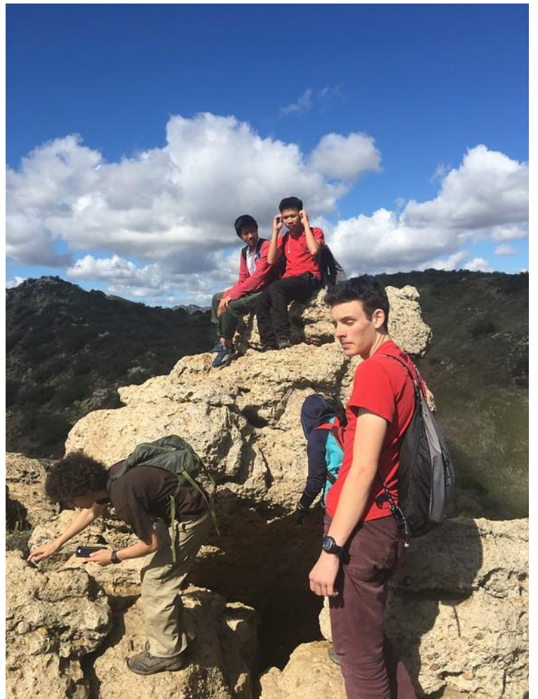
The Scouts on Castle Peak.