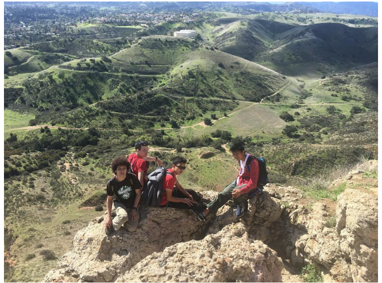
The Scouts take break on ridge.

After scrambling down the hill from Castle Peak, we rejoined El Escorpion Trail for the short walk back to the car. We stopped at In-n-Out Burger in Canoga Park, where I discovered that I had lost my wallet! I went back to the trailhead, where I had last seen it, but couldn't find it. That was disappointing, but I have since then replaced all the important stuff, and no one ran up charges on my credit cards, so all is good.