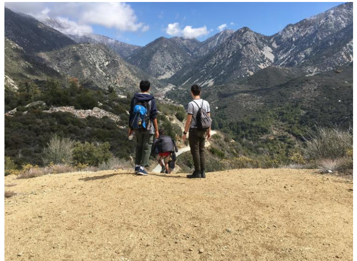
Starting the last steep scramble down to the car.

This was one of those hikes that are easy but still leaves your legs just a bit sore, so you know you got some exercise. A good way to start the weekend! --- Scoutmaster Marubayashi