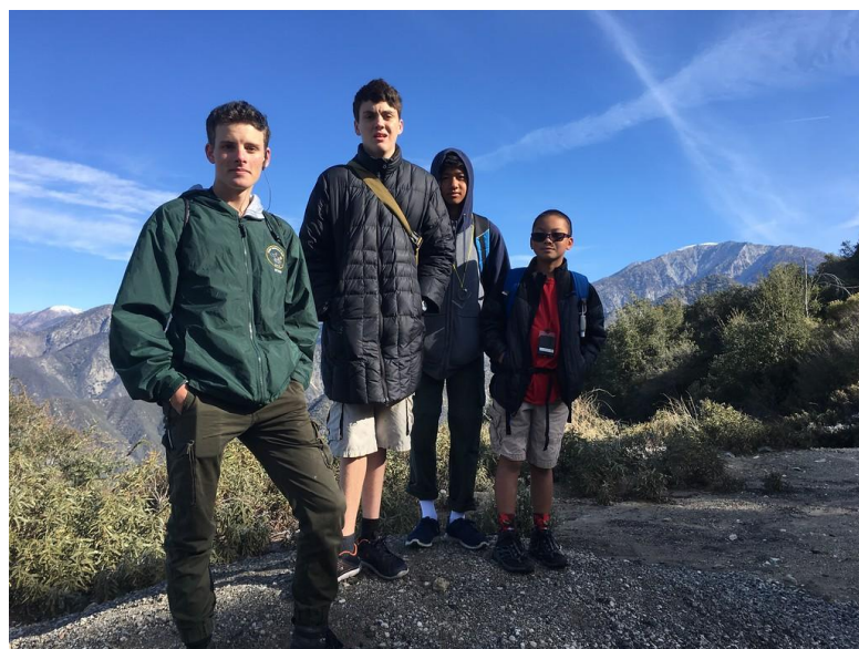
Second switchback, overlooking Mt. Baldy village.

On Saturday, March 24, Troop 314 went for a dayhike. This was originally going to be an overnight backpacking trip, but some of the boys said they did not have warm enough sleeping bags. So instead, we hiked to Sunset Peak.