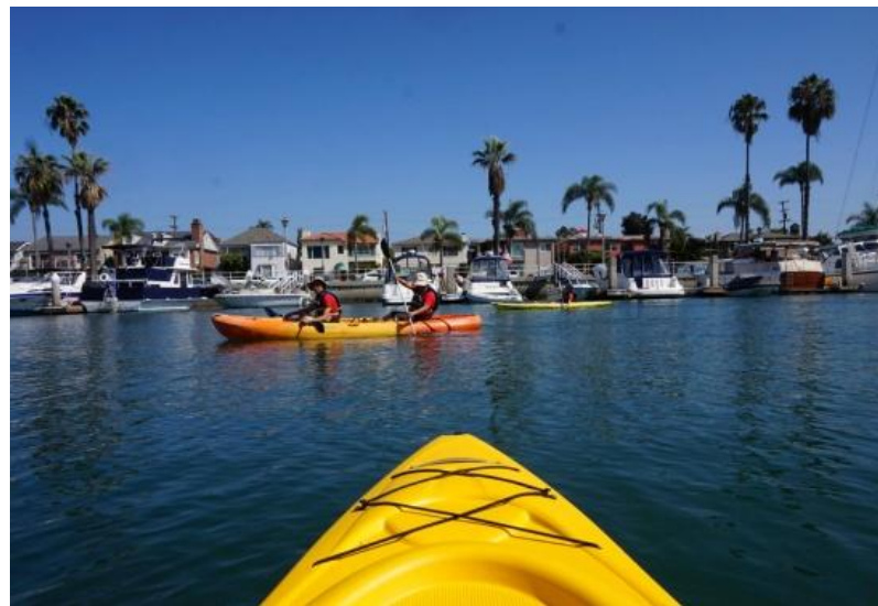
Beautiful day to be on the water