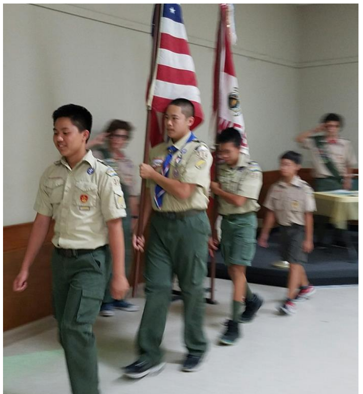
Retiring of the Colors.