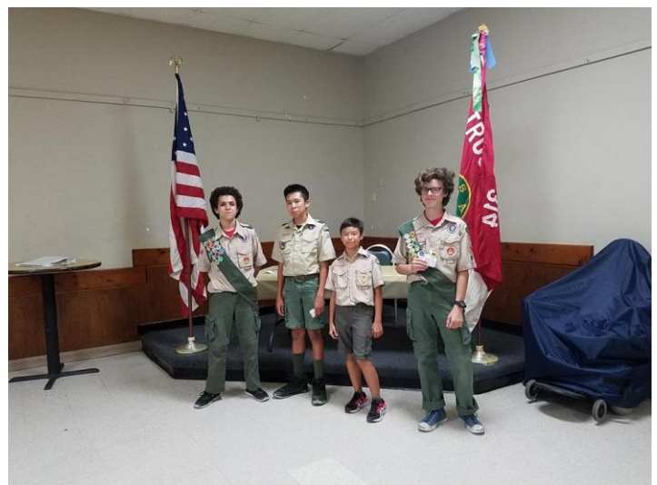
Summer camp merit badges awarded.