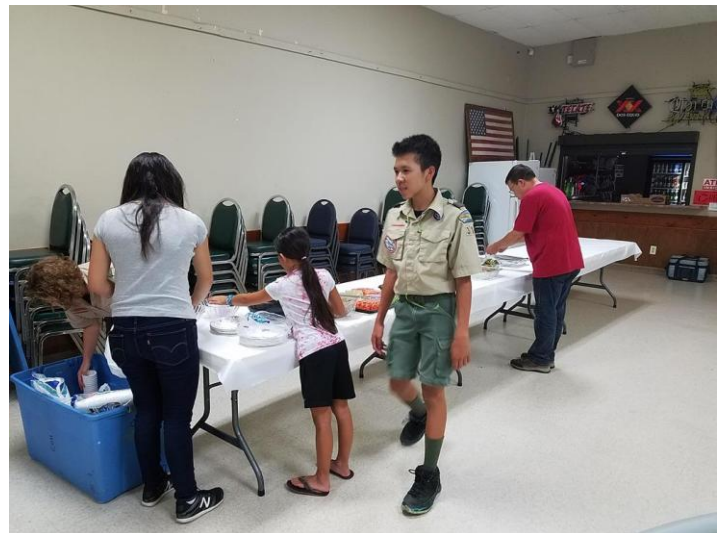
Time to eat.