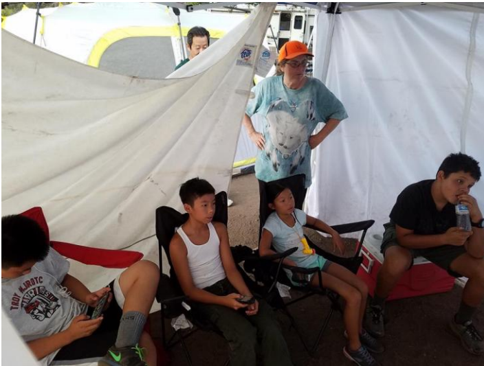
Movies in the wilderness. Modern technology is something.